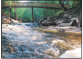
Big Shoals - Suwannee Rapids

This more than 4,000-acre area is bordered by the town of White Springs. Big Shoals is best known for its namesake, a one-mile stretch of rapids on the Suwannee River formed by water coursing over a limestone bed with rocky outcroppings. Riding in this area offers intermediate to expert bicyclists varied terrain with scenic vistas from high river bluffs. Big Shoals offers a mixture of sandhill and hammock roads and single-track trails. The paved Woodpecker Trail connects the two parking areas, and cyclists often visit Little Shoals, a smaller set of rapids, while in the area.