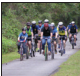
Tallahassee-St. Marks Historic Railroad State Trail

The paved trail runs from Florida's capital city, past the Apalachicola National Forest, to the coastal community of St. Marks. Cyclists will find fresh Florida seafood, fishing, and San Marcos de Apalache Historic State Park. Through the early 1900s, this historic railroad corridor was used to carry cotton from the plantation belt to the coast for shipment to textile mills in Europe. Today, a canopy of foliage overhangs the trail. Deer and foxes are occasional visitors.