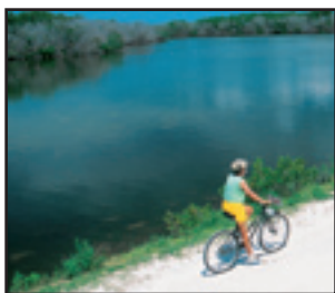
Gasparilla Island - Boca Grande Trail

This first paved rail trail built in Florida runs the length of Gasparilla Island through the town of Boca Grande. The railroad it replaced once brought phosphates from the mainland to the deepwater port on the southern tip of the island. Ride by stately homes, retail shops and swaying palms. The terrain is flat, the vegetation is lush and there's always something interesting to see, such as gopher tortoises crossing the trail. Gasparilla Island State Park, at the southern terminus of the trail, is home to the Boca Grande Lighthouse Museum.