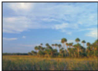
Everglades National Park

Bicycling at Shark Valley is a great way to experience the quiet beauty of the Florida Everglades. This flat, paved loop trail provides visitors with a gateway into the beautiful Everglades National Park, located between Naples and Miami. Along the trail, where limestone was quarried from borrow pits to build the trailbed, cyclists can see alligators, blue heron, egrets, deer, turtles and snail kites. An observation tower at the half-way point provides a panoramic view of the Everglades.