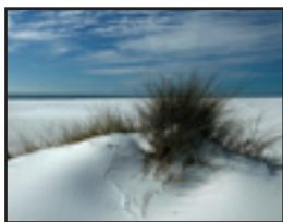
Topsail Preserve State Park found near Timpochee

This trail is a popular path through the Beaches of South Walton. Named after Timpochee Kinnard, the most influential Indian Chief of the Euchee Indians, this paved path parallels Scenic Highway 30-A, surveying the sugar-sand beaches and emerald green waters of the Gulf. The path winds through 7 of 13 distinct beach communities, with unique coastal names such as Dune Allen, Blue Mountain, Grayton Beach, Santa Rosa Beach, Watercolor, Seaside and Water Sound. From migrating flocks of birds to blooming wildflowers and trees, this breezy coastal ride showcases nature's beauty all year long.