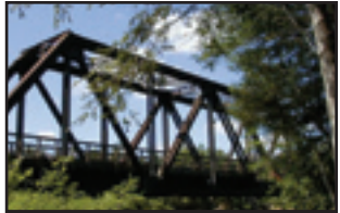
Nature Coast State Trail Railroad Bridge

This paved trail provides an excellent opportunity to experience the Sunshine State's "off the beaten path." The trail consists of two primary alignments built along former rail lines that meet at Wilcox Junction, connecting the communities of Cross City, Trenton, Fanning Springs and Chiefland. A historic train trestle carries the trail