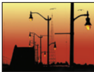
Friendship TrailBridge at Sunset

The pavement of this trail is the deck of the "old" Gandy Bridge, saved from demolition at the urging of local citizens of Hillsborough and Pinellas counties when a new bridge across Tampa Bay was built for the Gandy Highway in the late 1990s. Connecting the Tampa and St. Petersburg areas, the TrailBridge is now used by bicyclists, walkers, skaters and even fishermen, and is a good way to catch bay breezes all year long. Users may see dolphins jumping in the bay and brown-headed pelicans flying above.