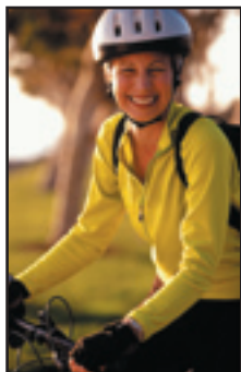
Enjoying one of the many bicycle trails throughout Florida